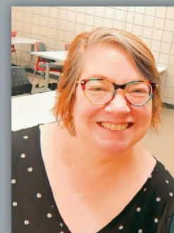
Sarah Duncan Melville School of Business