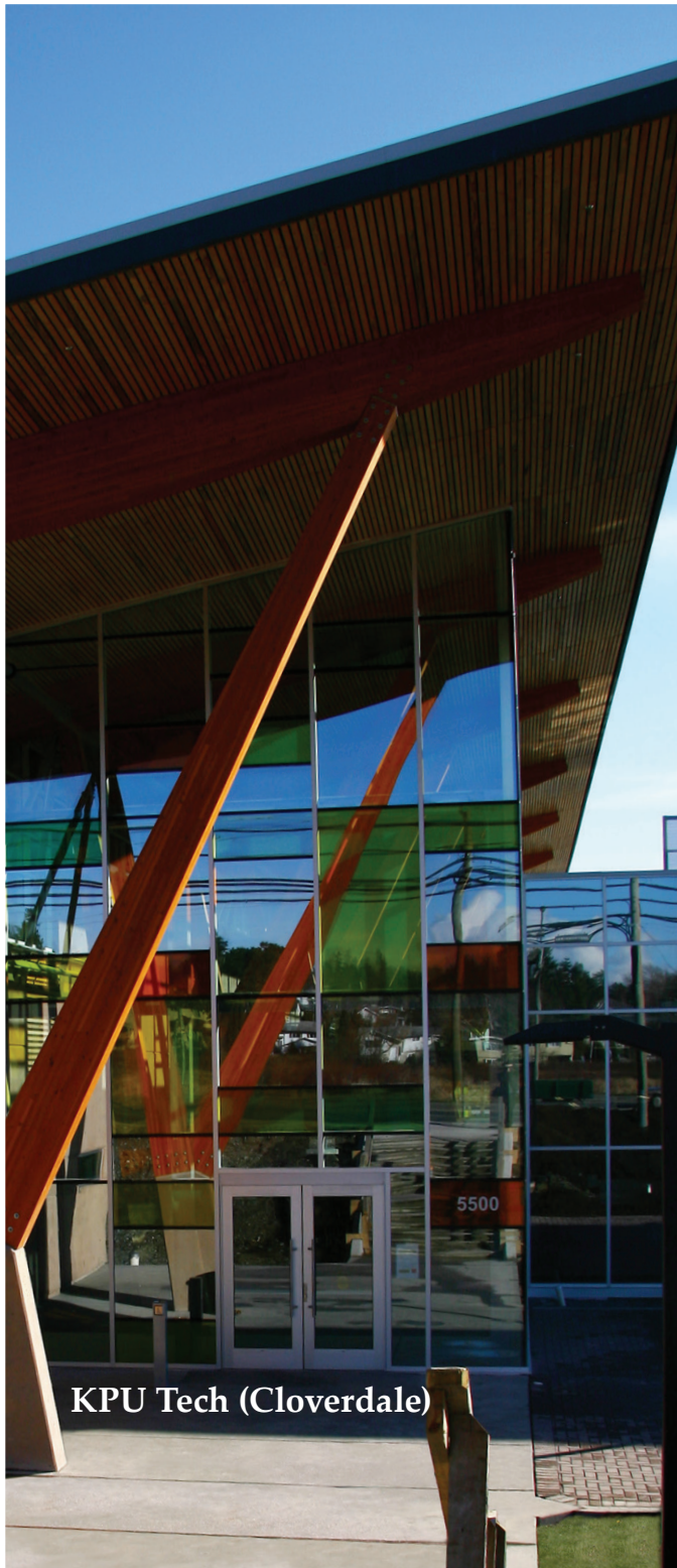
KPU Tech (Cloverdale)